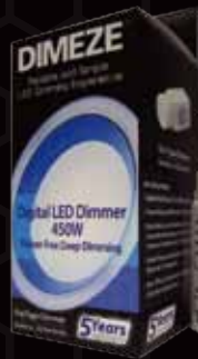
DZ2G450DIAL 450W Phase Dimmer