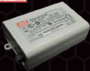
PCD Series AC Dimmable Driver