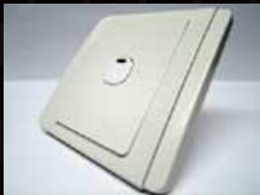
The LED indicator faces upward after done 完成後 LED 指示燈向上