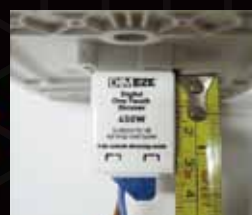
DZ2G450DIAL / 34mm DZ1G450CAPS / 43mm DZ1G1TEN / 35mm