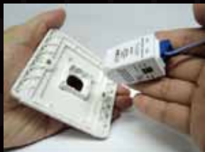
Insert dimmer to TV Plate 把調光器安裝到 TV 面板