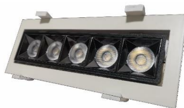
Linear Light Bar