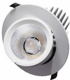
Adjustable Recessed Downlight

Besides controller and drivers, we also provide our own Tune-able White Directional LED Lighting Fixtures with High Color Rendering (CRI) performance suitable for Diamonds Lighting, making it much easier for customers to work with.